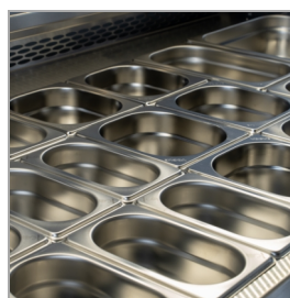
Designed for GN1/1 pans, not supplied